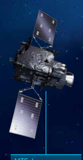
RAPID SCANNING SERVICE 16 spectral channels over Europe every 2.5 minutes